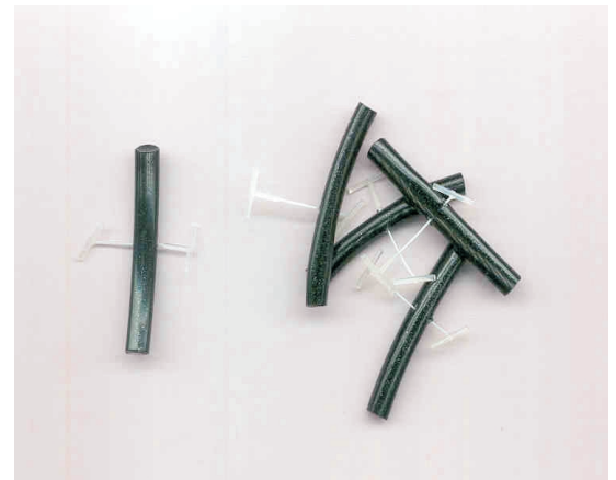
The CM FlexLure is only available from Phero Tech Inc.

The CM FlexLure can be used in all trap designs recommended for monitoring codling moth.